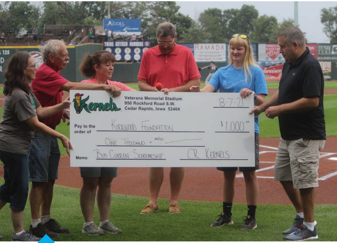
Presenting the Bud Curran Scholarship check at home plate before a Kernels game.

Honorees were selected for their extraordinary athletic ability, leadership roles, and public service both during and since their time at Kirkwood. Nominations were sought in July from present and retired Kirkwood coaches, administrators, alumni, faculty, and staff.